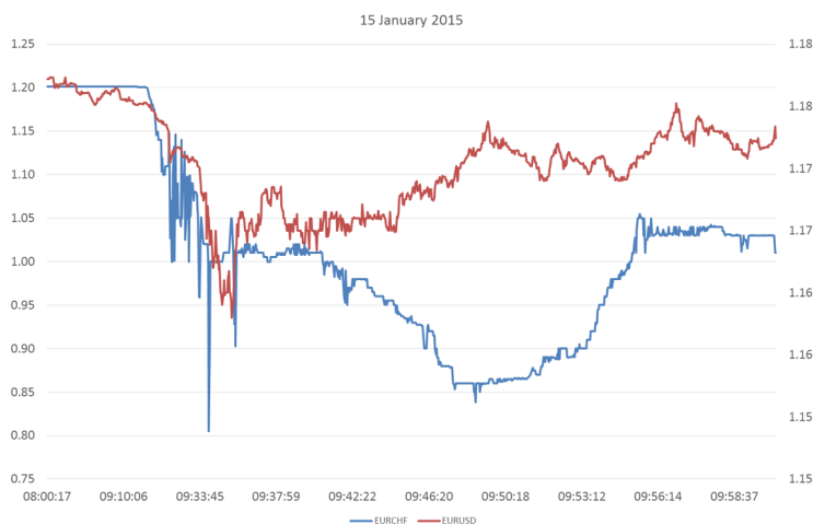
Figure 2. Swiss franc against the euro and dollar on the day of the depegging announcement

the Swiss Franc depegging event of 15th January, 2015 whereby the Swiss authorities removed their large limit order on EBS that was supporting the desired price level. After a short while, this resulted in a rapid increase in the Swiss Franc from 1.20 to 0.80, and a subsequent recovery to 1.05. The downward trajectory was chaotic and there was gapping, meaning that many price points in between were not visited. Although the primary cause of the "crash" is obvious and reflecting fundamental information, the way it transpired is worrisome.