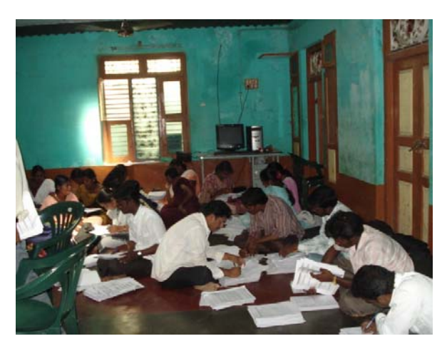
Some of the investigators in Tamil Nadu