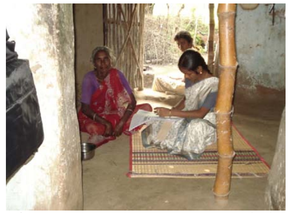
Conducting practise interview in the field (TN)